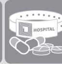
Point of Care